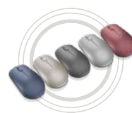
Lenovo 530 Wireless Mouse