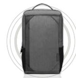
Lenovo 15.6" Laptop Urban Backpack B530