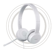
Lenovo 110 USB Stereo Headset